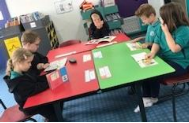
Prep -2 Literacy.